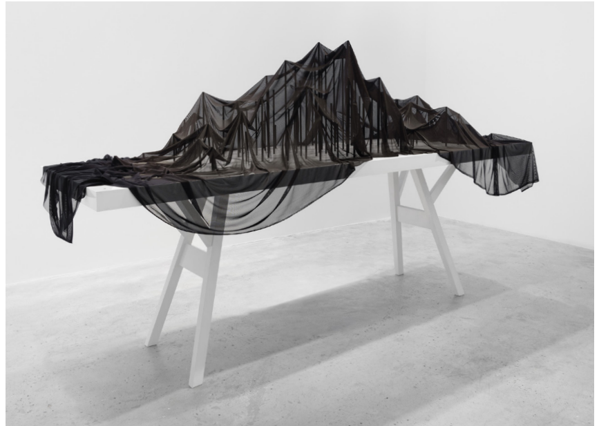
Manuela Ribadeneira, No hay paisaje sin quién mire [There is no landscape without viewer] , 2022, Table, wooden dowels, fabric, variable dimensions, table: 244 x 76 x 84 cm

Cecilia Brunson Projects is pleased to present a solo show by Manuela Ribadeneira (b.1966, Quito, Ecuador). The artist's first show at CBP serves as a continuation of her recent explorations of landscape or paisaje . This series of works stems from her upbringing in Quito. The Ecuadorian capital is surrounded by mountains and volcanoes (both active and dormant) and so they have been an ever-present feature of her life. For Ribadeneira, a paisaje is a place of identity – carried in an individual's memory and psychological makeup. Her interest lies in the relationship between an individual and their surroundings, the construction of the paisaje which occurs through looking and listening. She suggests that a paisaje is “a place from which by looking you define a surrounding.”