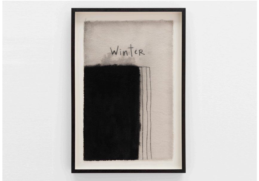
Untitled , 2019, charcoal and pigments in acrylic resin on canvas, 50 × 31cm