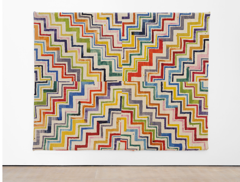
David Batchelor, Covid Variation , 2020, wool tapestry, produced with the Taller Mexicano de Gobelinos, Guadalajara, 255 x 322 cm